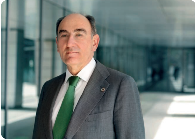
Ignacio S. Galán Executive Chairman of Iberdrola

The Code of Conduct for administrators, professionals and suppliers reflects the commitment of Iberdrola Group to the principles of business ethics and transparency in all areas of activity, establishing a set of principles and guidelines of conduct aimed at guaranteeing the ethical and responsible behaviour of all the Group's professionals and administrators.